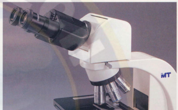
MA957 ERGONOMIC TILTING BINOCULAR HEAD (SIEDENTOPF TYPE)