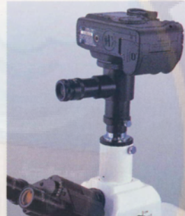
MA150/60 Camera attachment

These attachments are used to mount the camera with T2 adapter ring to the photo tube.