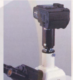
MA150/50 Camera attachment