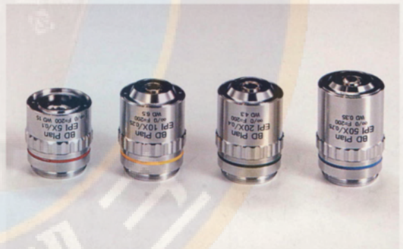
PLAN EPI OBJECTIVES